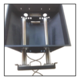
STEP 9: Slide the burner assembly out of the barbecue frame.