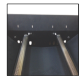
STEP 7: Turn around the barbecue frame.