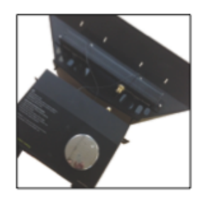
STEP 4: Carefully remove the control panel.