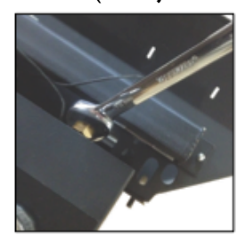
STEP 2: Unscrew the nut from the manifold (wrench 15).