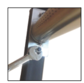
STEP 10: Unscrew the M5 bolts to loosen the burner tube from the manifold tube.