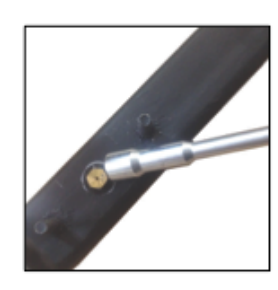
STEP 12: Loosen the orifices (wrench 7) and replace them with the orifices for Natural Gas.and air inlets.

Reverse the procedure (follow all steps above) to reassemble the Flame gas burner