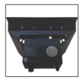
STEP 1: Put the Flame on a flat and solid surface.

Please follow the steps below to replace the orifices (or injectors/jets) and air inlets: